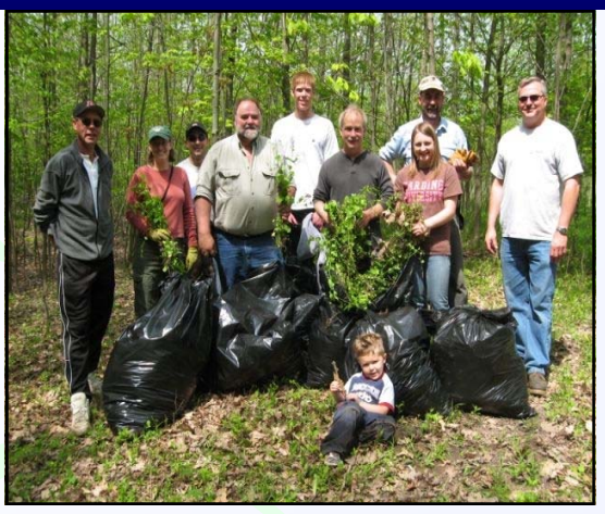
May 3 garlic pull volunteers

One of our first activities just took place last week. We pulled garlic mustard for a few hours on May 3 at the site of last year's extremely successful mustard pull. Numerous volunteers from We Energies Environmental Department and the Ulao Creek Partnership joined forces to pull over a dozen 40-gallon bags filled with garlic mustard at STH 32 landfill property and Latzl property. See (http:// www.ulaocreek.org/) for pictures from last