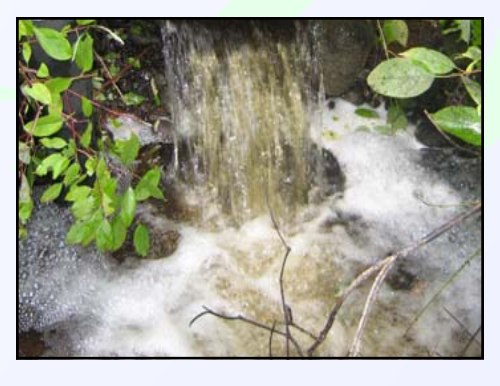
Example of an Impassable Perched Culvert in Ozaukee County