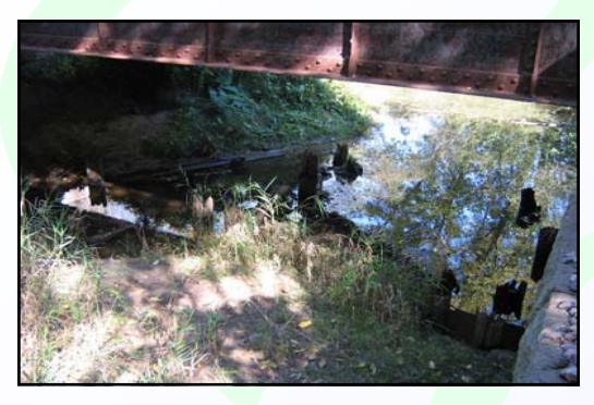
Sediment Deposited Below a Railroad Bridge

Unfortunately, dams, culverts, and other artificial structures create barriers that fragment and isolate parts of many rivers and streams. As a result, a wide range of aquatic species lose access to critical habitat. This loss ultimately diminishes the recreational opportunities available to fishermen, river enthusiasts, and outdoor patrons in many watersheds.