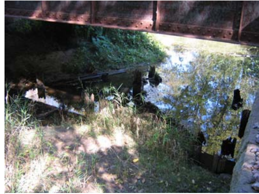
Sediment Deposited Below a Railroad Bridge Impeding Aquatic Life Passage In Ulao Creek

Unfortunately, dams, culverts, and other artificial structures create barriers that fragment and isolate parts of many rivers and streams. As a result, a wide range of aquatic species lose access to critical habitat. This loss ultimately diminishes the recreational opportunities available to fishermen, river enthusiasts, and outdoor patrons in many watersheds.