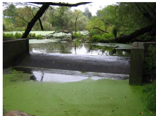
A Low-Head Dam Fragmenting Aquatic Habitats in an Ozaukee County Creek