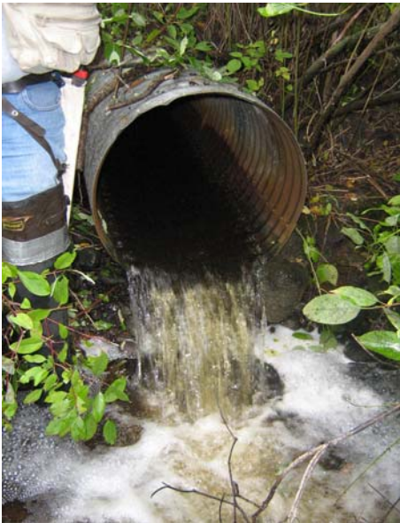
Example of an Impassable Perched Culvert in Ozaukee County

Fortunately, many adverse stream barrier affects can be reversed by removing artificial barriers. Recent trends in natural resources management increasingly support barrier removal as a means of reclaiming stream habitat, rejuvenating fisheries, and improving public recreational opportunities. Identifying and evaluating barriers is the first step in this process.