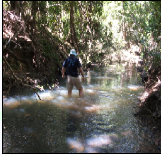
The Ulao Creek is wonderful resource right in our very own backyard.

I will remain an active member of the UCP and look forward to directing my efforts toward on the ground projects. One of the first efforts I am soliciting your support is for our 4 th annual invasive species control day. To date, we have pulled over 1,000 gallons of garlic mustard and dame's rocket. On the 8 th of May, we will gather at 7:30 and work on pulling